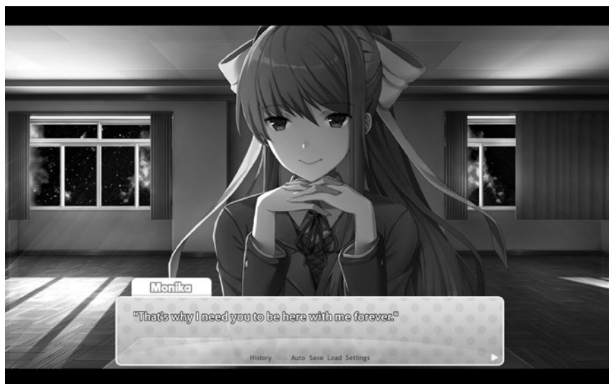
d. Doki Doki Literature Club . Monika in her forever room

Ultimately the game reaches the point where Monika turns off everything except for herself and an empty room for her to sit in and wait for us. Every time we start the game, she will be there still. But the game is not finished yet. The player can choose to let Monika be or to delete her file from the game files. The second option triggers one of three possible endings, depending on the player's previous actions in the game ("Possible Endings"). The ending, whatever it may be, is permanent, though; the end screen will still be shown when the player enters the game. The only possibility to relive it is to reinstall it.