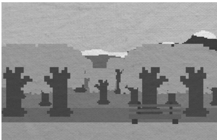
e. One Chance . The second end screen of the game

only once – therefore the narrative is not only linear but unique as well: it cannot be repeated and overwritten in the memory of the player by another rendering of events. These two altered mechanics are essentially a matter of one key difference between One Chance and other games: in One Chance the player loses control over time.