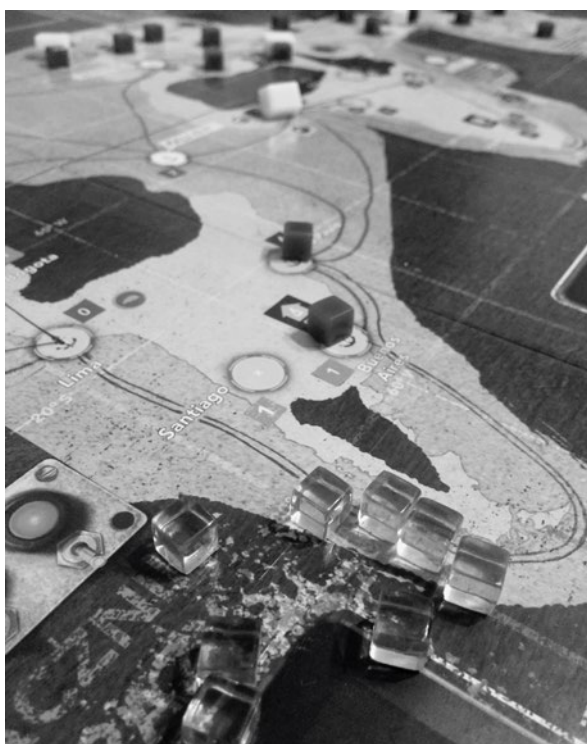
a. Pandemic Legacy: Season 2 . The board